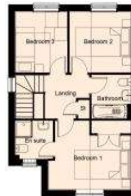
FIRST FLOOR GIA - 476sq. ft / 44.29sq.m TOTAL = 952sq. ft.