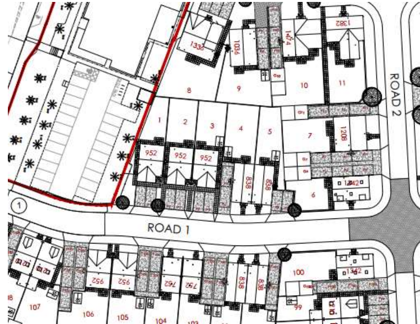
Proposed Section 73 layout