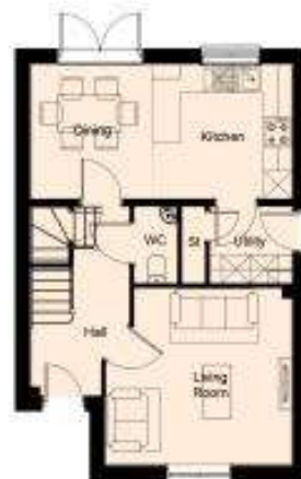
GROUND FLOOR GIA - 476sq. ft / 44.29sq.m