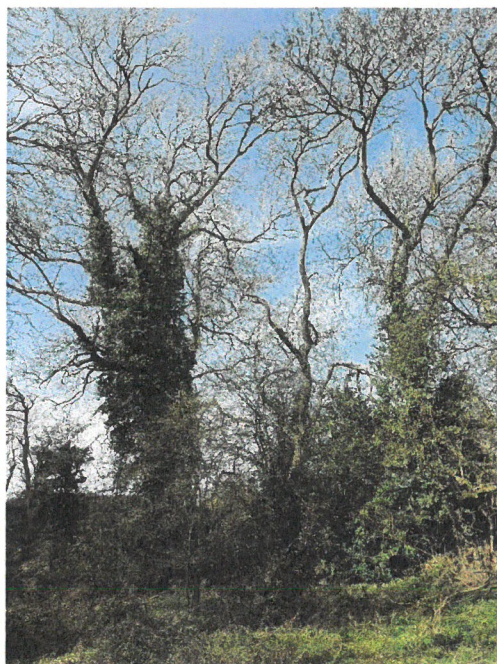
IMAGE 3 (above): Tree T7 viewed from within the woodland area. Clarification on which is T7 is sought.