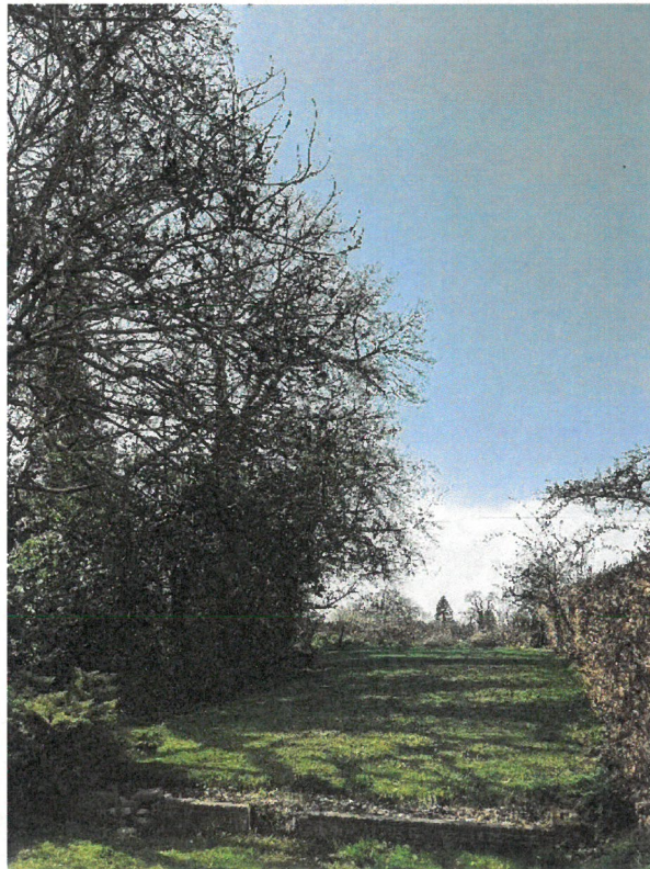
IMAGE 1 (above): This view is within Mr. Smith's rear garden, looking west. The Ash tree T7 is one of these three. It is unclear which one.

IMAGE 2 (below): Looking at these trees face on, the southerly view.