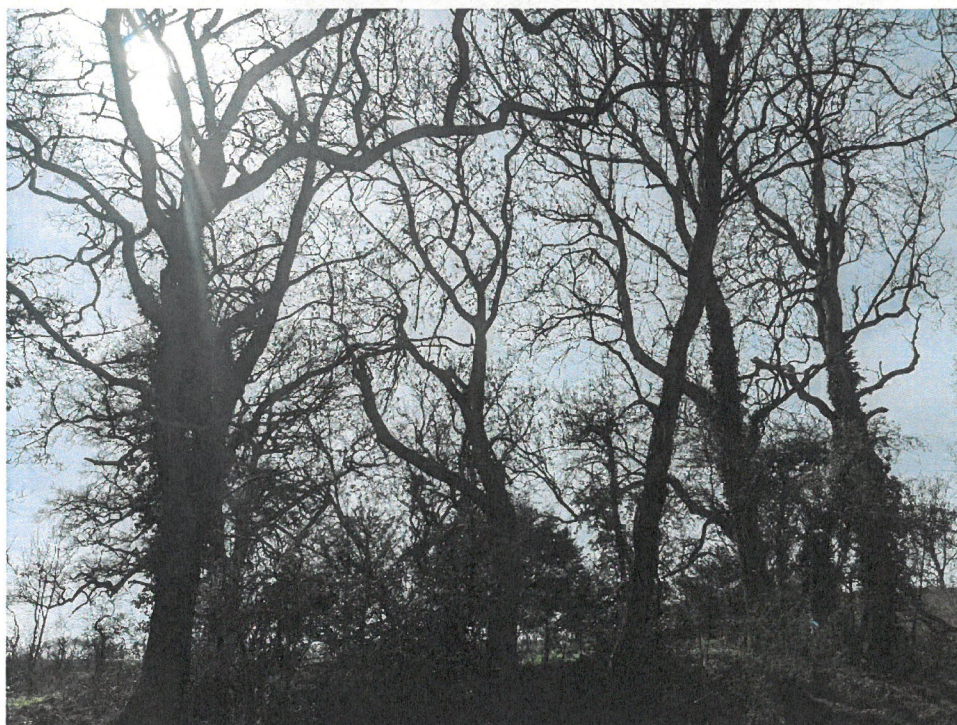
IMAGE 4 (below): Trees within the group T2-6. Clarification of which are included is sought.