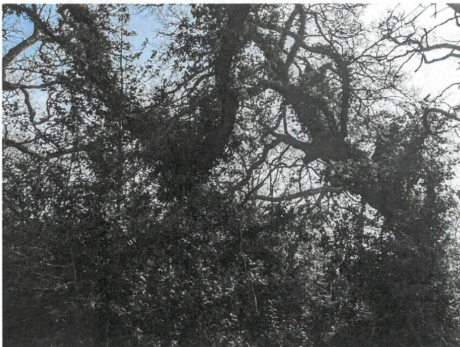
IMAGE 2 (below): Looking at these trees face on, the southerly view.

IMAGE 1 (above): This view is within Mr. Smith's rear garden, looking west. The Ash tree T7 is one of these three. It is unclear which one.