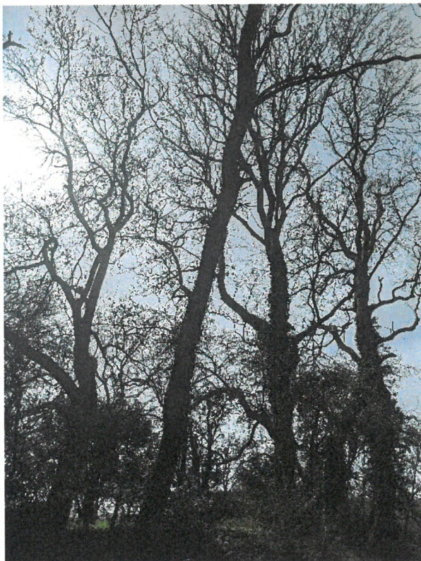
IMAGE 6 (below): Two of these trees are T5 & T6. It is unclear which ones are included.